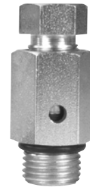
SAE Straight Thread