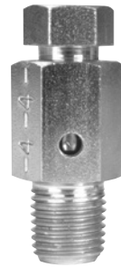
Tapered Pipe Thread

It is easily installed. Please make sure when installing Lenz bleed valve to position the vent opening away from operating personnel. Always open the bleed valve slowly, some weepage will occur when the valve is opened.